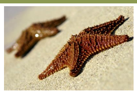
Make A Difference

Once upon a time there was a wise man who used to go to the ocean to do his writing. He had a habit of walking on the beach before he began his work. One day he was walking along the shore. As he looked down the beach, he saw a human figure moving like a dancer. He smiled to himself to think of someone who would dance to the day. So he began to walk faster to catch up. As he got closer, he saw that it was a young man and the young man wasn't dancing, but instead he was reaching down to the shore, picking up something and very gently throwing it into the ocean. As he got closer he called out, "Good morning! What are you doing?" The young man paused, looked up and replied, "Throwing starfish in the ocean." "I guess I should have asked, why are you throwing starfish in the ocean?" "The sun is up and the tide is going out. And if I don't throw them in they'll die." "But, young man, don't you realize that there are miles and miles of beach and starfish all along it. You can't possibly make a difference!" The young man listened politely. Then bent down, picked another starfish and threw it into the sea, past the breaking waves and said, "It made a difference for that one."